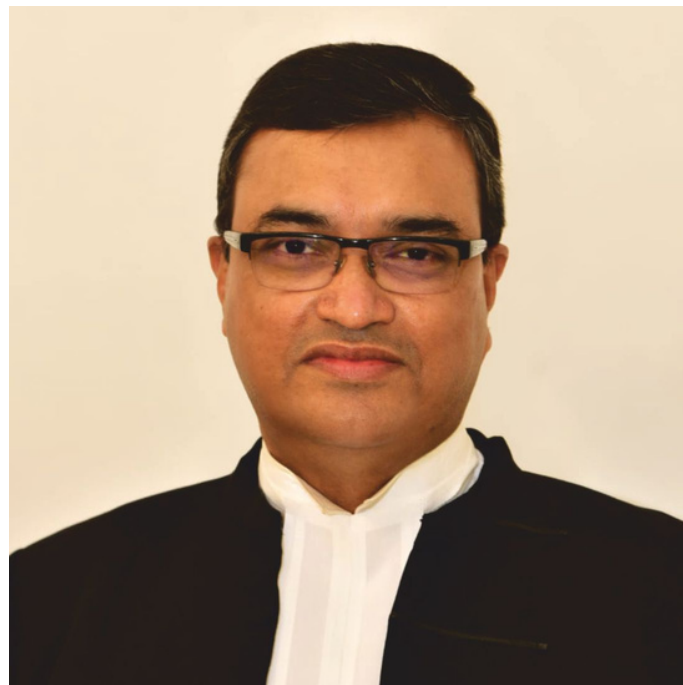
Hon'ble Justice Shri. Dipankar Dutta Hon'ble Judge, High Court of Bombay Hon'ble Pro-Chancellor MNLU Mumbai