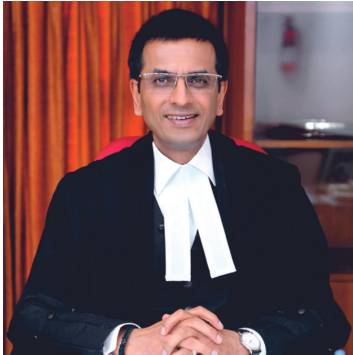
Hon'ble Dr. Shri. Justice D.Y. Chandrachud Hon'ble Judge Supreme Court of India Hon'ble Chancellor, MNLU Mumbai